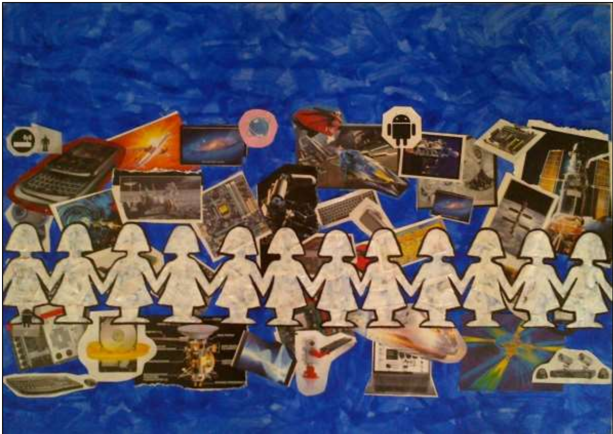
Figure 1: Engendering technology-empowering women i (Source: painting-collage by the artist Areti Kamperidis in Nancy Pascall's private collection)

"We are living in this digital bazaar where anything that is not built for the network age is going to crack under its pressure. Future jobs are likely to pair computer intelligence with the creative, social and emotional skills of human beings (Elliott, 2017: 3).