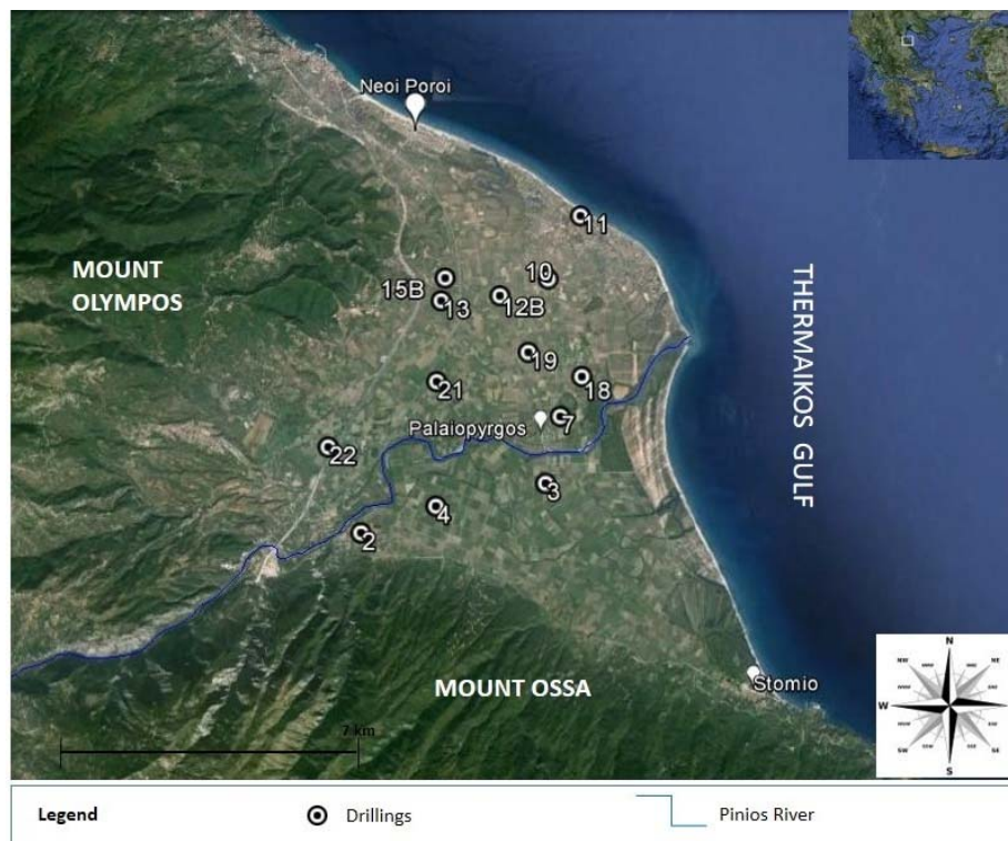
Figure 1. Map of the Pinios deltaic area and location of the drillings

The first year of sampling, commenced in October 2012 and a total number of 49 samples were collected from 13 groundwater drillings (for location see Figure 1) on a seasonal basis, i.e. October 2012, January 2013, April 2013 and July 2013.